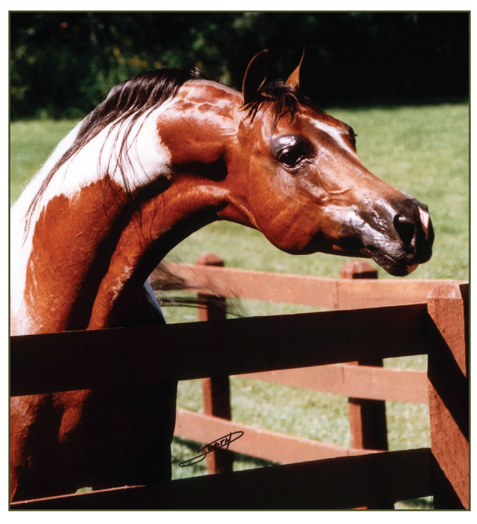
The Color Of Fame (Colour Me Hot x Baroness Reverie).

virtual sweep of the big prizes, The Color Of Fame get were also named to the Reserve Champion titles in all three classes, with DR Gilty Pleasures (x Alovalie) taking Reserve in the Half-Arabian Mare Halter Stock/Hunter Amateur class and the Half-Arabian Futurity Filly class, and The Heiress To Fame (x DR Fostoria Doll) going Reserve Champion in the Half-Arabian Halter Open Mare Stock/Hunter Type class. The 2004 Nationals was also memorable as the first of The Color Of Fame's performance horses captured Top Ten awards, including MR Nice Guy, AW Fames Ovation and SP Fortune Five Hundred. Clearly, the Arabian community learned, this horse could produce winners in both halter and performance. He was different from the others.